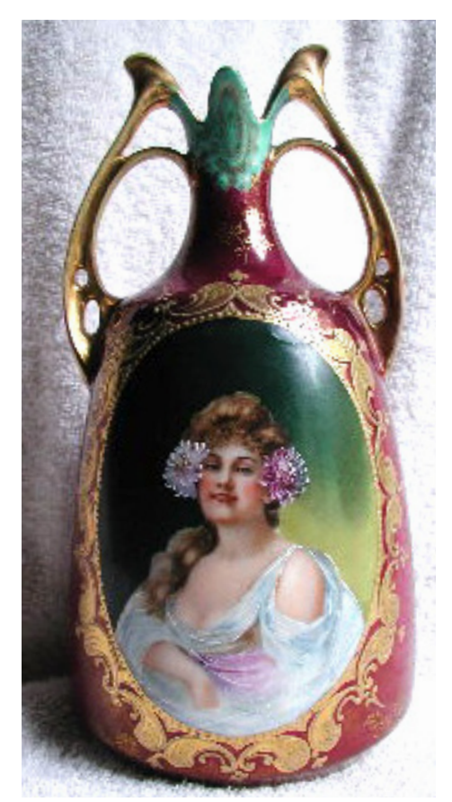
Vase with EZ Clermont mark.