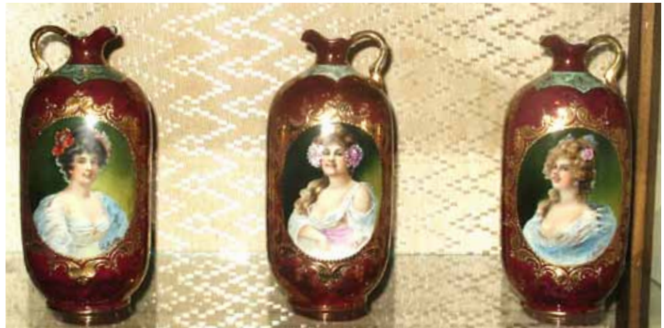
Three ewers (beehive marks) Note that one ewer is a left-handed ewer.

from the Warwick factory of West Virginia and Clarus Ware of the Pope Gosser factory of Ohio.