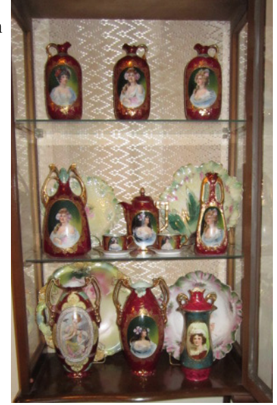
Cabinet display with grouping of Victorian women pieces.

members have posted information and photos of a wide and interesting variety. The challenges that come with searching for pieces to fit a particular collecting interest add to the enjoyment and adventure that we experience as collectors of this artistic china and craftsmanship.