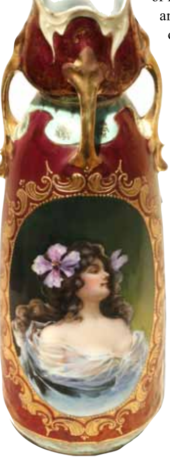
Vase with Prov. Sxe. mark.