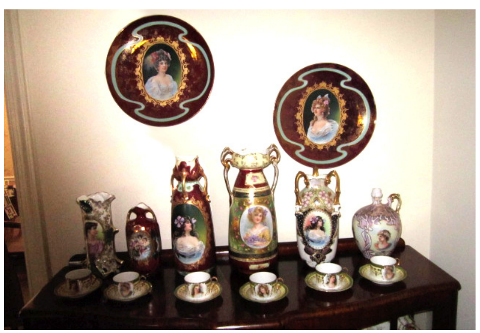
Two 13 inch (33 cm.) wall plaques (with beehive marks) that have pierced holes on the undersides to enable wall-hanging.