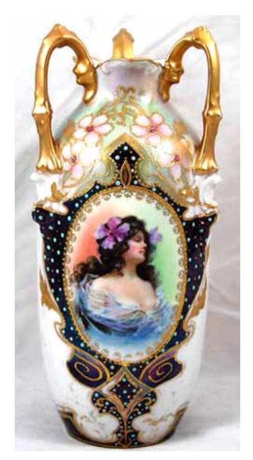
Vase with the beehive mark that includes a cobalt blue frame, stylized flowers and stippling;