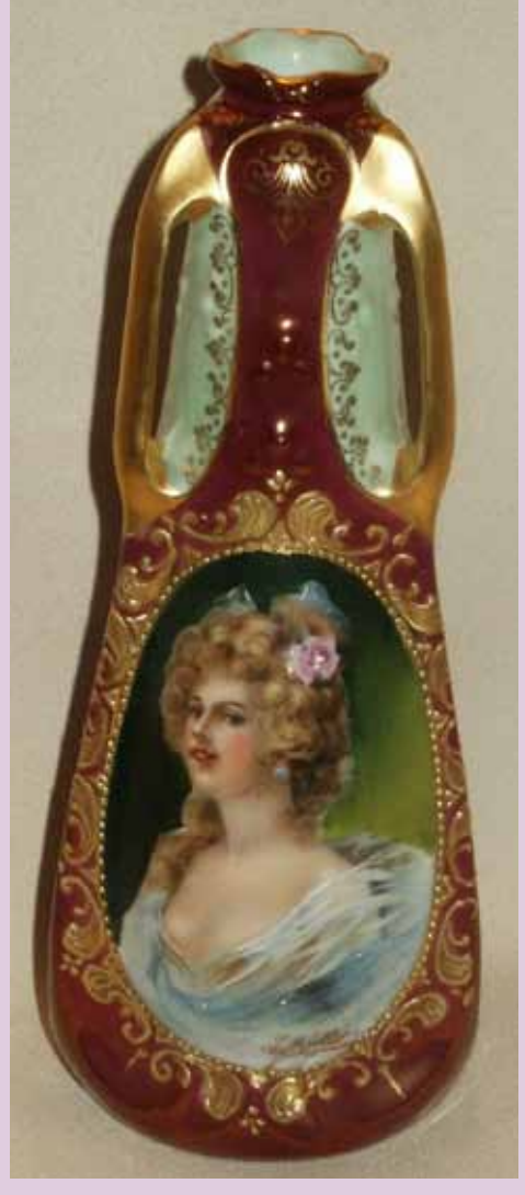
Vases with beehive mark.